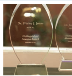
NYU Silver Alumni Day 2011