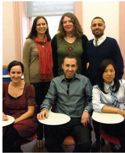
Members of the 2011 entering class

Guilamo-Ramos acknowledges that the doctoral program looks different than it did 10 or 20 years ago. "The profession, particularly in doctoral education, has evolved in its commitment to developing empirically informed knowledge, and our doctoral program reflects this broader trend."