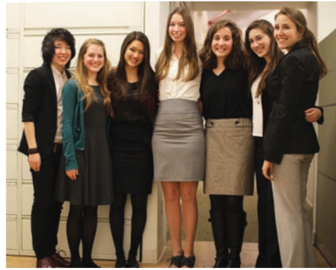
The founders of Youth Take Charge

Youth Take Charge will host workshops at schools and provide viable and effective ways for high school students to get involved and