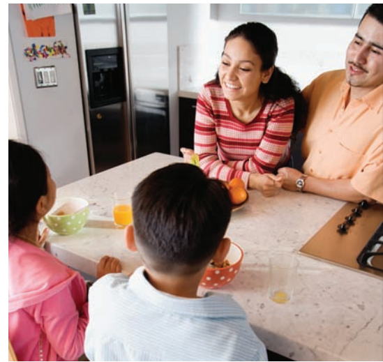
How well prepared is the next generation to succeed in school and beyond?