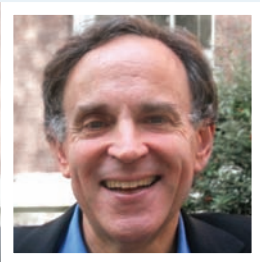
The Silver School Hosts Conference on DSM-5 Proposals